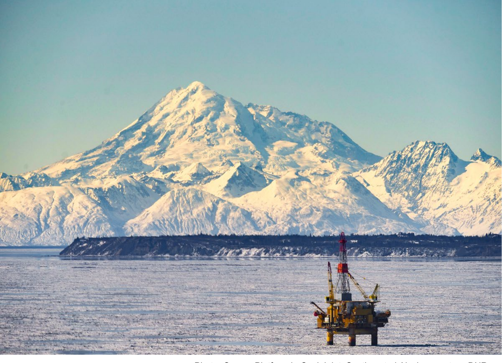
Photo: Osprey Platform in Cook Inlet, Southcentral Alaska, courtesy DNR