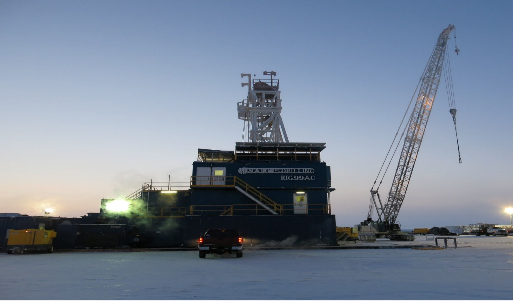
Photo: Repsol Drill Rig 99AC on ice pad for exploration