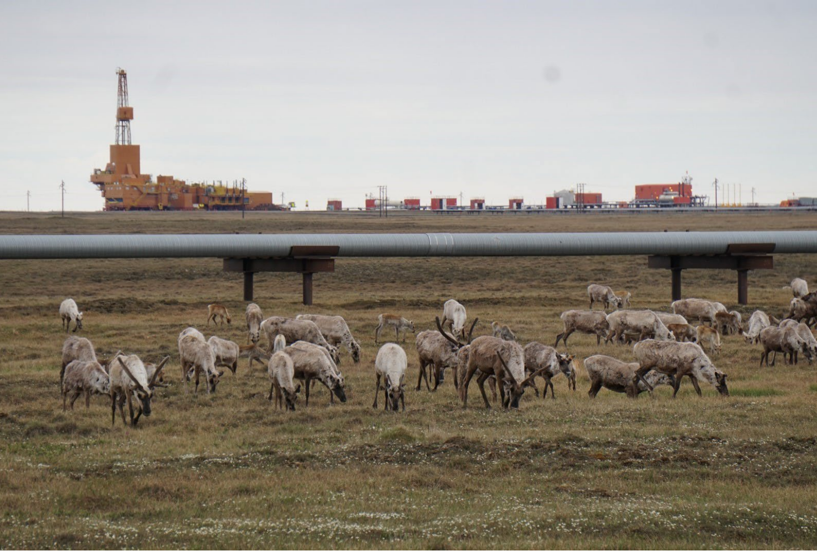
Photo: Caribou and the Trans-Alaska Pipeline in the Kuparuk River Unit, North Slope, Alaska, courtesy DNR