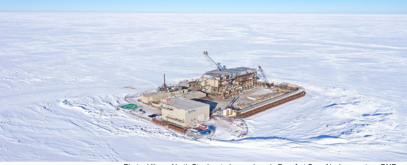
Photo: Hilcorp North Star located near shore in Beaufort Sea, Alaska, courtesy DNR