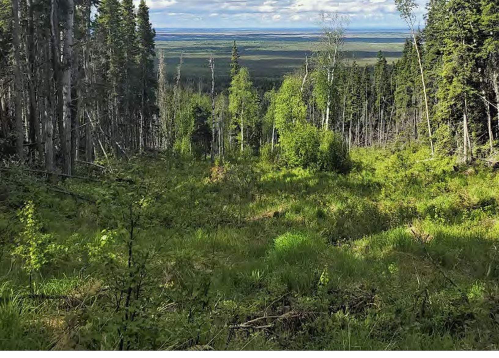
Photo: Forest regeneration, Tanana Valley State Forest in Interior Alaska, courtesy DNR