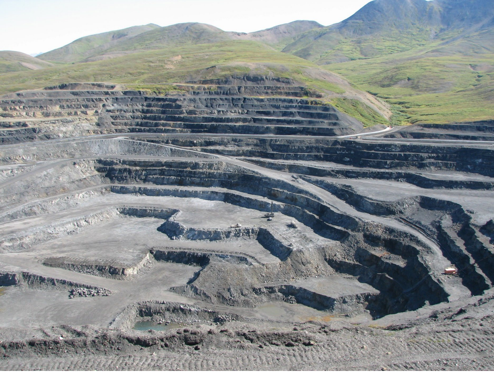
Photo: Red Dog Mine operated by Teck Resources on NANA land in Northwest Alaska, courtesy DNR